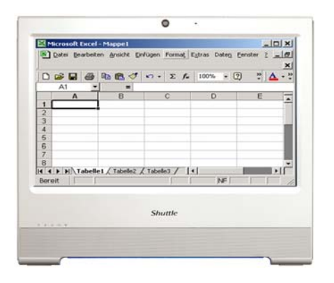
Work Banking, Shopping, Office, Stock trading