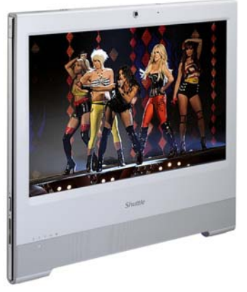
Entertainment Music, Movies, Photo gallery, TV* *) TV tuner USB stick required