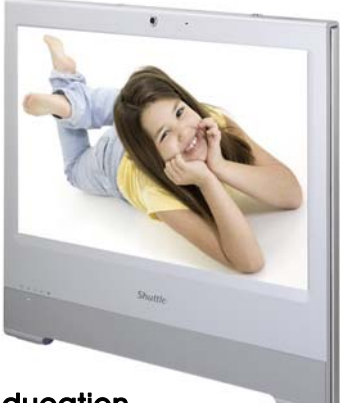
Education In schools, at home, for children and adults