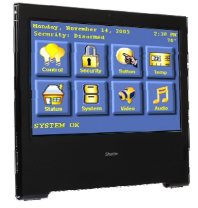
Control Surveillance, Home Automation, Control device