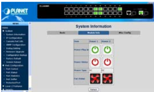
Power / FAN Status Monitoring

The Managed VDSL2 Switch is equipped with temperature sensor and cooling fans to ensure reliable operation. Whenever there is abnormal temperature detected or cooling fan service stops, the Managed VDSL2 Switch would display related information on the Web management interface. Therefore, it helps the administrator to efficiently manage the Managed VDSL2 Switch operation.