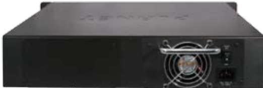
VC-2400MR – One 100~240V AC

The VC-2400MR Series supports the optional hot-swappable Redundant Power System (RPS) to ensure continuous operation. The VC-2400MR equips with one 100~240V AC power supply unit and the VC-2400MR48 equips with one DC -48V power supply unit on their standard package. To enhance the reliability, both the VC-2400MR and VC-2400MR48 provide one spare power supply unit slot for optional 100~240V AC or DC -48V redundant power supply installation. The continuous power systems are specifically designed to handle high tech facilities requiring the highest power integrity available. Also, the -48V DC power supply implemented makes the VC-2400MR Series VDSL2 Switch as a telecom level device that can be located at the electronic room.