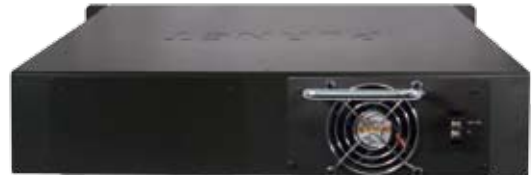
VC-2400MR48 – One -48V DC