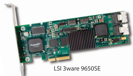
LSI 3ware 9650SE

RAID 6 eliminates the risk of data loss if a second hard disk drive fails while the RAID array is rebuilding. In a 3ware RAID 6 system, two sets of parity are simultaneously calculated, written, and rotated across all the drives. This second parity calculation enables the array to survive up to two drive failures without losing data, significantly improving fault tolerance. The 3ware parallel XOR RAID 6 parity generation algorithm maximizes RAID 6 throughput, so that RAID 6 enabled 9650SE controllers deliver unequaled RAID 6 performance.