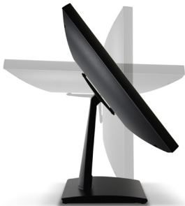
90-degrees of Adjustment