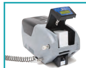
Optional locking input hopper and Kensington® ClickSafe™ cable

Corporate Headquarters Canada 703 Evans Avenue Toronto, Ontario M9C 5E9 Canada tel: +1 416.621.1911 fax: +1 416.621.8875