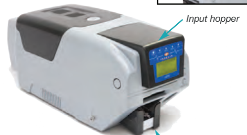
Javelin J230i Auto feed