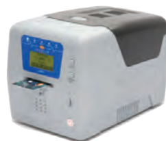
Javelin J200i Manual feed