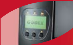
Upgraded Graphic LCD