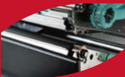
Adjustable sensor kit