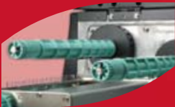
Ribbon supply and rewind module