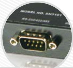
RS-232/422/485 3-in-1 serial Port