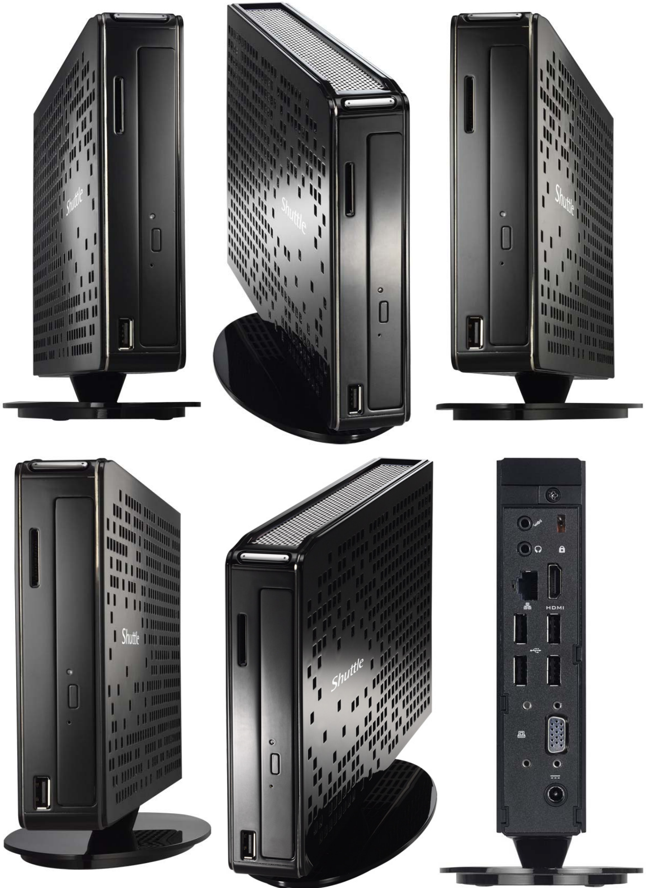
Images are only for illustration purposes. The optical drive is not included.