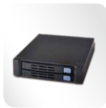
1 x 3.5" bay for FDD or SK51201