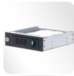
1 x 5.25" bay for ODD or SK31101