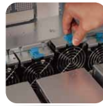
5 x middle 80mm hot-swap fans