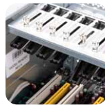
Tool-less adjustable card retainer for full height and low profile cards