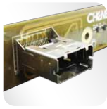
Optional 6Gb/s mini-SAS backplane