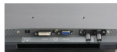
Looping BNC video connector for multiple display connections