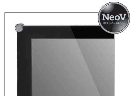
NeoV™ Optical Glass for hard glass protection and strong metal casing for secure mounting