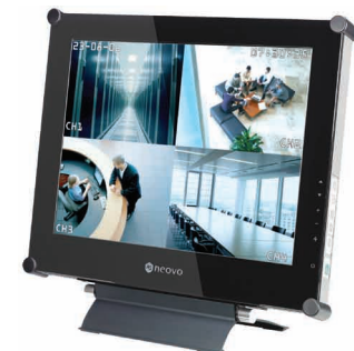
Specifically designed and tested for commercial video security applications